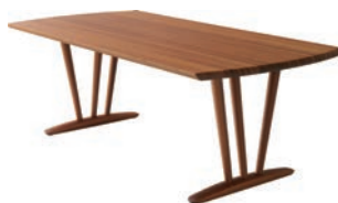
LD Table KJ364WP W160×D90×H65 cm KJ365WP W180×D90×H65 cm