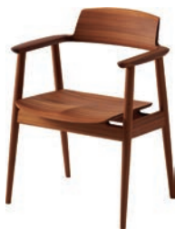
Chair KJ201A W59×D52.5×H78 SH41 AH65 cm