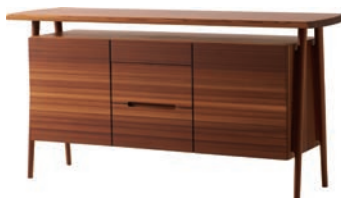
Cabinet KJ566 W160×D48×H80 cm