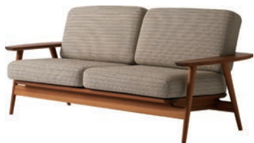
Sofa KJ102WL W173.5×D79.5×H78.5 SH40 AH51 cm KJ102SO W193.5×D79.5×H78.5 SH40 AH51 cm