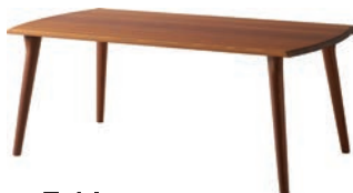
Table KJ344WP W160×D90×H70 cm KJ345WP W180×D90×H70 cm