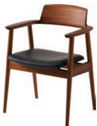
Chair KJ200A W59×D52.5×H78 SH41 AH65 cm