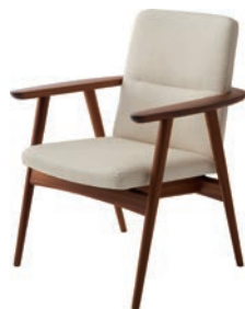
LD Chair KJ260A W60.5×D63×H78.5 SH37.5 AH56.5 cm